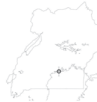
1. ENTEBBE Bounds 434093, 1814, 443073, 10754